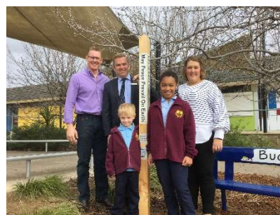
Peace Pole 19 of 100 Brisbane / Peace Pole 46 of 100 Chapel Hill / Peace Pole 5 of 100 St John Vianney

Each School or park where Peace Poles have been located are invited to participate in World Peace Day ceremonies on 21 st September each year by holding a short ceremony at their Peace Pole. The local Rotary Club could send members to deliver a keynote Peace message to each school.